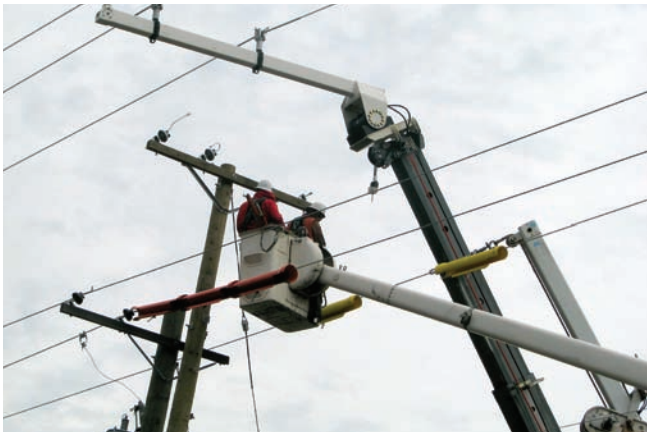
Live Line Solution's Insulated Conductor Support Jibs (ICSJ) and LinePro HA keep linemen safe and increase productivity by incorporating radio-controlled, hydraulic-actuated articulation.