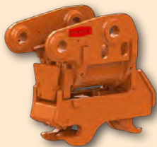
Hydraulic Pin Grab